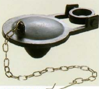
CTR-P/N 5208-2 FLAPPER TANK BALL W/GUIDE ( WITH 9" CHAIN & HOOK )