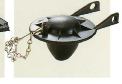
CTR-P/N 2545 FOR NEW CRANE STYLE FLAPPER TANK BALL ( WITH 9" CHAIN & HOOK )