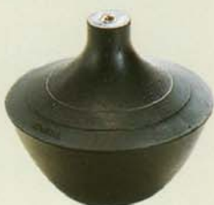
CTR-P/N 106 UNIVERSAL FIT TANK BALL ( W/O TIP )