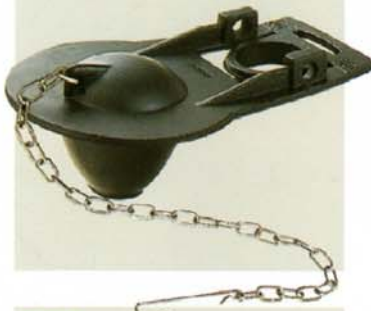
CTR-P/N 102 FLAPPER TANK BALL 3 WAY ( WITH 9" CHAIN & HOOK )