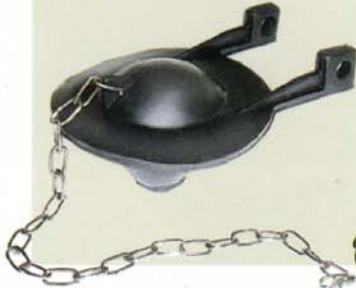
CTR-P/N 075B FLAPPER TANK BALL ( WITH 9" CHAIN & HOOK )