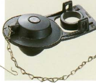
CTR-P/N 2205 FLAPPER TANK BALL ( WITH 9" CHAIN & HOOK )