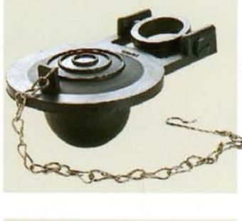
CTR-P/N 75-005 FLAPPER TANK BALL W/GUIDE ( WITH 9" CHAIN & HOOK )