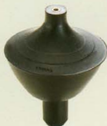
CTR-P/N 107 UNIVERSAL FIT TANK BALL ( W/ TIP )