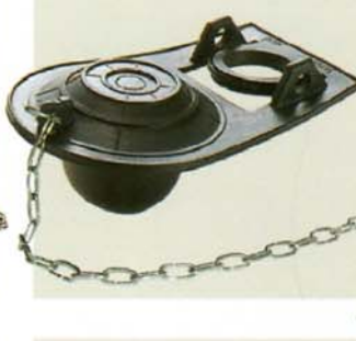
CTR-P/N 8100 FLAPPER TANK BALL ( WITH 9" CHAIN & HOOK )