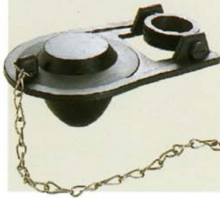
CTR-P/N 2025-2 FLAPPER TANK BALL W/GUIDE ( WITH 9" CHAIN & HOOK )