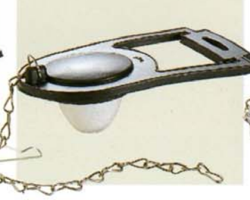
CTR-P/N 2055 FLAPPER TANK BALL STYROFOAM CENTER ( WITH 9" CHAIN & HOOK )