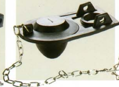
CTR-P/N 2025 FLAPPER TANK BALL ( WITH 9" CHAIN & HOOK )