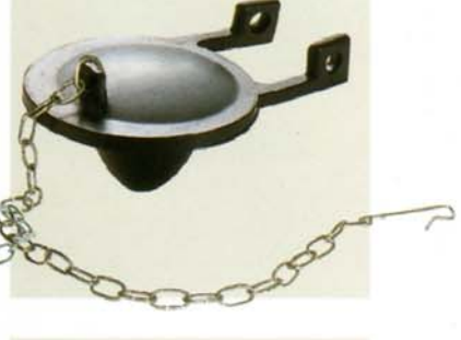
CTR-P/N 5208-1 FLAPPER TANK BALL W/O GUIDE ( WITH 9" CHAIN & HOOK )